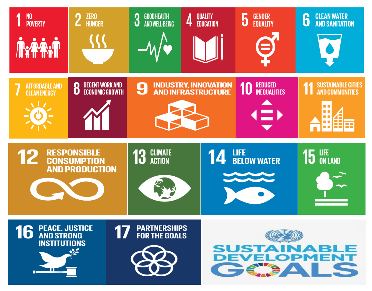
Fig. 1. Objectives in sphere of sustainable development / OUN.