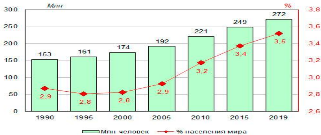
Figure 1. Dynamics of the number of international migrants, [1].

Today, many migrants take advantage of the global economy to increase their mobility as highly skilled professionals or entrepreneurs. The level of qualification in the processes of international labor migration plays an important role, as the countries of migration seek to attract highly qualified personnel, establishing favorable rules of entry and residence of such workers. Modern migration processes are characterized by the emergence of new forms of mobility, such as reverse or circular migration. The barrier between migration and tourism is becoming blurred as some people travel as tourists to check out potential migration routes. An important factor in migration today is family migration, due to moving to work or residence in another country of spouses, children and other relatives of previous primary migrants. Family migration also contributes to the development of migration networks connecting the countries of departure and the countries of arrival of international migrants. Migration can change demographic, economic and social structures and create a new cultural diversity that often calls into question national identity. Global cultural exchange, facilitated by modern means of communication and the distribution of print and electronic media, can also contribute to the growth of migration aspirations. Motives for migration can be of different nature: political, economic, environmental, military.