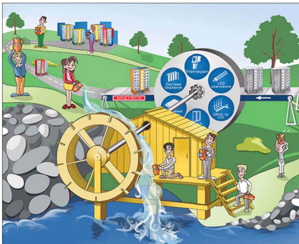
Fig. 2. Principles of work of the “Revolver fund” – of grant of new loans are due to a return earlier given out

2020 became the year of tests on endurance and search of new decisions not only in Ukraine but also in the whole world. However, a pandemic and difficult economic situation did not prevent to realization of plans from energymodernisation of houses after the programs “Energyhouse” and the “Warm credits”.