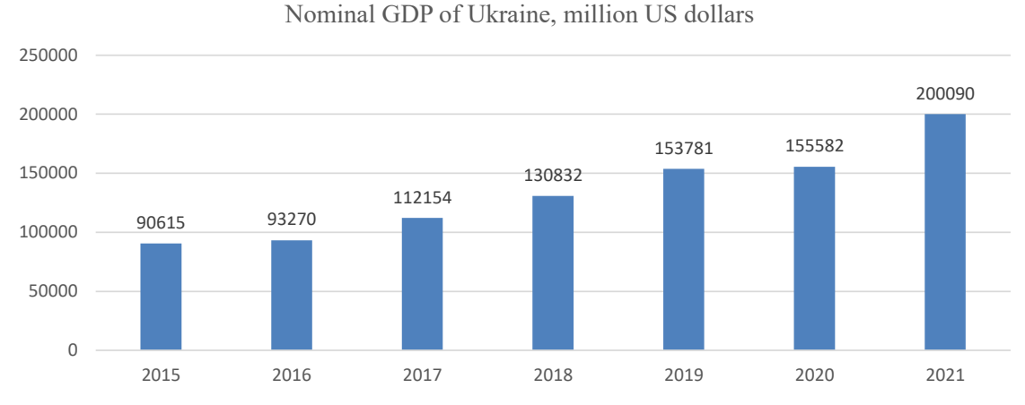
Fig. 2 – Nominal GDP of Ukraine in the period 2015–2021 [7]

Against the background of growth in the volume of export-import transactions on the world market, imports to Ukraine are steadily ahead of exports, and EU countries are no exception. However, European integration processes have become one of the factors that have a positive impact on the country's economy due to the active growth of export operations by 9.45 billion US dollars over the last