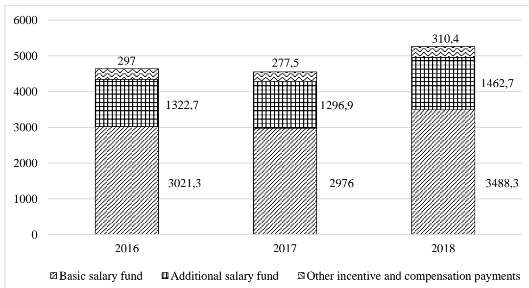
Fig. 1. The structure of the payroll

Analyzing the changes in the structure of the payroll at LLC «Rassvet LTD», it is seen that the largest share in the total amount of wages is the basic salary (average 65,6%). The additional salary fund averages 28,3%. The lowest percentage is made up of other incentive and compensation payments (on average 6,1%). The causes and consequences of this trend are diverse.