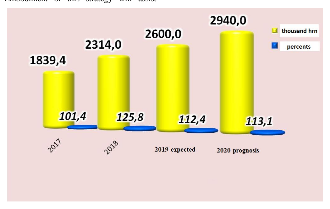
Figure 1 – Dynamics of height of volume of the realized industrial products of the Zaporizhzhia district of the Zaporizhzhia region (commodities, services) [3]