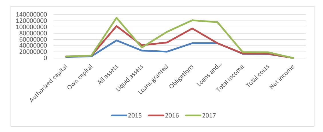
Fig. 2. Capital adequacy ratios based on the official data of NB RK [3, 4, 5]

The bank's equity capital is the basis of its development and the potential for the prevention of risks in banking. The equity capital adequately and efficiently managed banks are unlikely to be able to carry out their active operations in the period when their own capital is insufficient compared to banks, with a high probability of losses and low levels of business venture. Therefore, central banks of many countries increase the regulatory requirements for the size and structure of equity capital of second-tier banks.