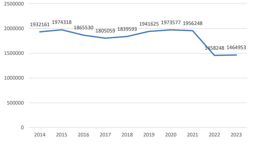
Fig. 1 – Number of enterprises in Ukraine in 2014–2023.