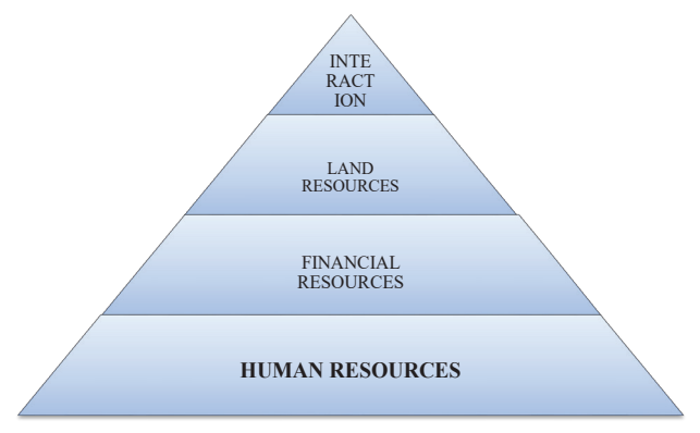
Figure 2 – The structure of the community in the form of a pyramid

Considering the importance and priority of the elements of the community, in our opinion, its structure can be represented in the form of a pyramid (Fig. 2).